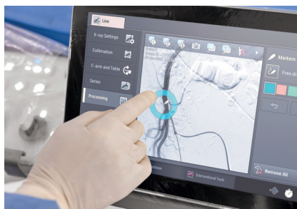
Touchscreen module Pro

The standard Windows 10 platform can help support compliance with the latest security and standards to protect patient data. It can also accommodate new software options to extend your system's clinical relevance over time.